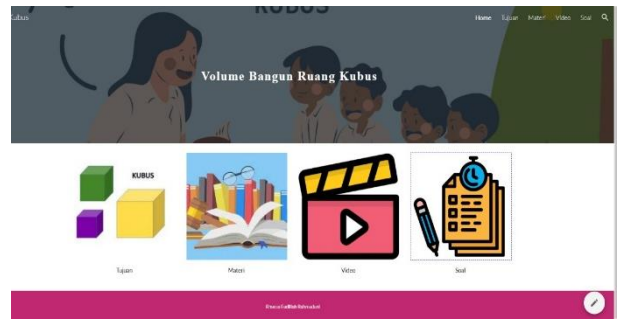
Figure 1. Design Web Case Study 2