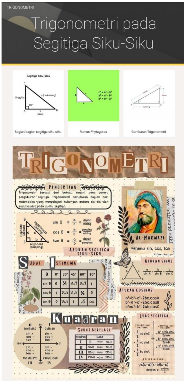
Figure 1. Design Web Case Study 1

Based on the analysis, a microsite and Google Sites were designed, incorporating various interactive features like online quizzes, educational videos, and discussion forums. The site's layout was designed to be user-friendly and attractive, considering factors like color, layout, and navigation that would appeal to students. Each feature was designed to support the learning objectives.