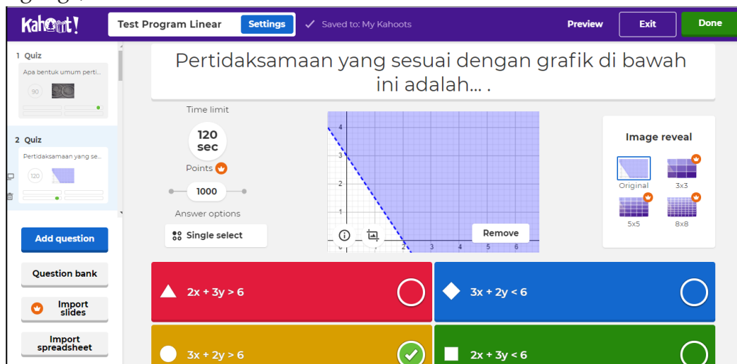
Figure 1. Output of Kahoot™

The data from this experiment was taken from students in grade XI who were using Kahoot. To measure the characteristics of this instrument, we need to take a test of validity and reliability. After questions are ordered, doing grain analysis as quantitative has a goal of testing question quality from content, language, and construction.