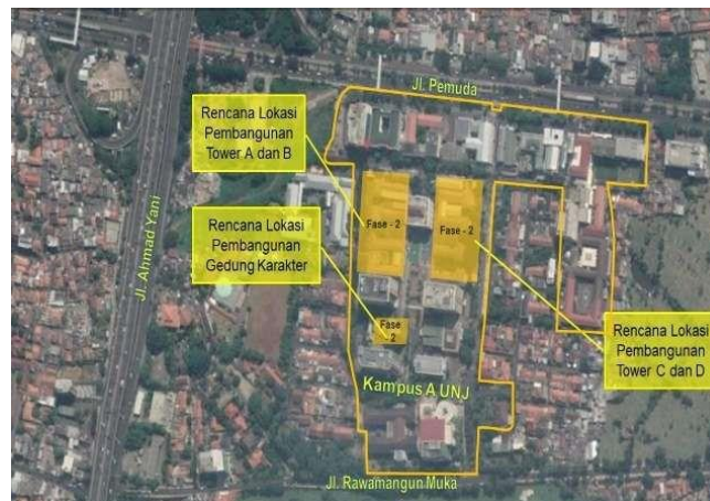
Figure 1. Construction Site of Tower A, B, C, D and Character Building at UNJ Campus A