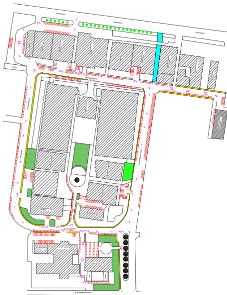
Figure 5. Modelling of Car Parking Arrangement in Campus A UNJ During Construction

This can make it difficult for drivers to find an empty parking space, especially considering the pattern of car parking on the UNJ campus A parking area rotates in one direction so that the opportunity to find an empty parking space during peak parking hours only has a chance to find an empty parking space.