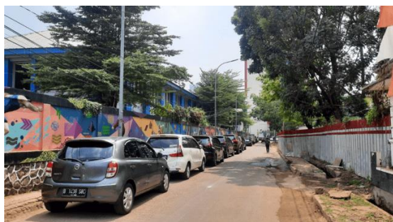
Figure 2. UNJ Campus A on-street parking condition

The population in this study is four-wheeled motorized vehicles owned by students, staff/faculty, and visitors at Campus A, State University of Jakarta. However, this study does not take into account online taxi cars, bajajs (a three-wheeled motor vehicle), and other cars that enter and exit the parking lot in less than 15 minutes because it is considered that the car is not parked.