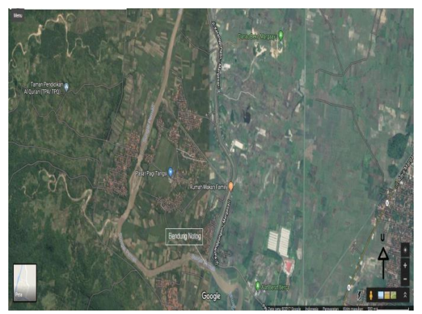
Figure 3.2 Research Location