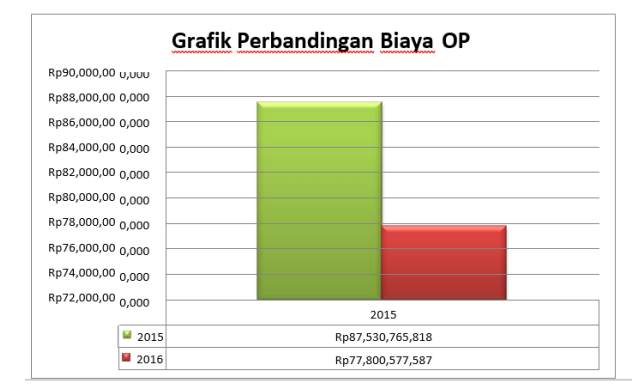
Figure 4.2 Cost Comparison chart Operation and Maintenance In Pemali

From the above data it can be seen that the Operation and Maintenance Costs in Pemali Irrigation Area in 2015 obtained the cost is Rp 87,530,765,818 and in 2016 obtained the cost is Rp 77,800,577,587 of these data can be seen that AKNOP decreased costs.